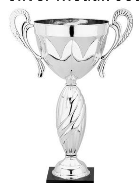
$500 usd for Team extra $200 for most Helpful player + Winners Tshirts